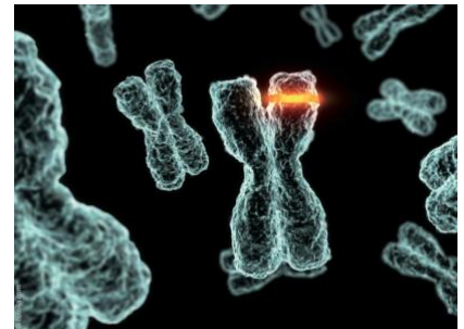
Master of Science in Molecular Life Sciences (MSc MLS)

Particular emphasis is placed on practical work/research projects throughout the Master's programme with: